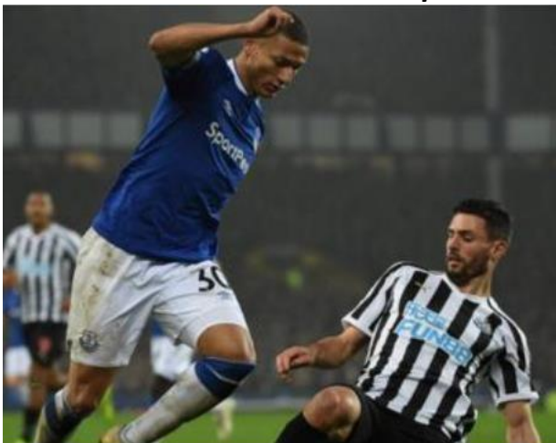
Richarlison in action against Newcastle he bagged a goal to hit 10 points